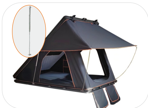
Stainless Steel Gas Strut