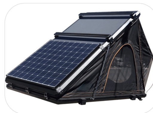
Flexible Solar Panel