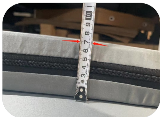
7cm Thickness Mattress